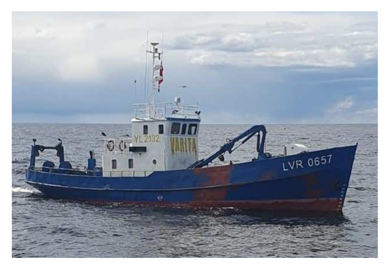
Marine Accident Investigation Unit Brivibas 58, Riga, LV-1011