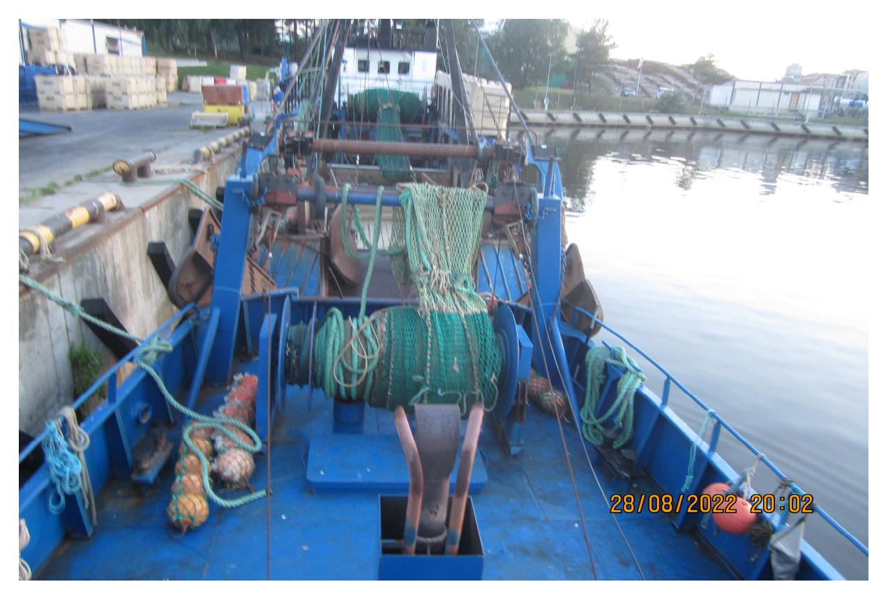
Figure 3. Trawl winch