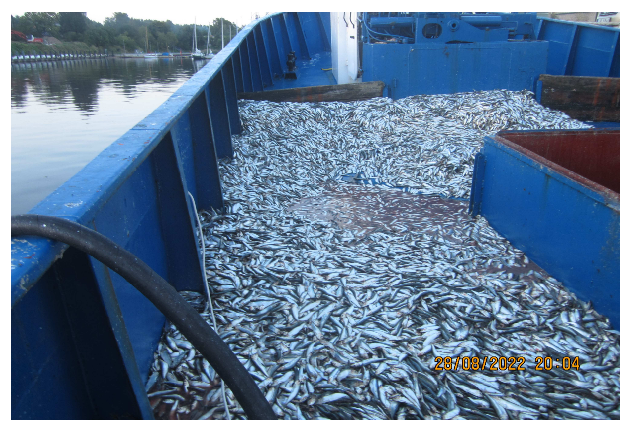
Figure 1. Fish released on deck

In this situation the rope was under the fish. Taking empty segment from the hook and releasing it to the water the trawl was going dawn fast under the weight of fish. The rope appeared between the lags of fisherman pressing his one leg to the railing and pooled him into the water. He just shouted "STOP" and was pooled out into the sea. Crewmembers tried to rescue him, but no one saw him on surface. As from testimonies of the crewmembers, it happened within one second.