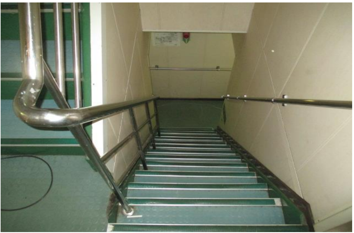
Figure 3: The accommodation's internal ladder from where it is assumed that the C/E fell