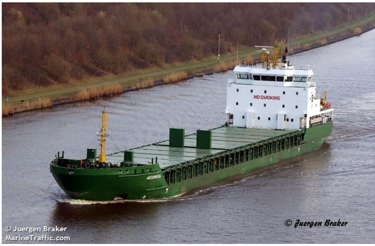
Figure 1: The "Vasterbotten"