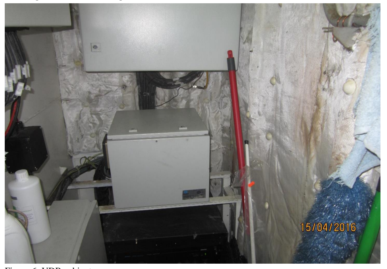
Figure 6: VDR cabinet

Type: VDR-100 G2S S-VDR (Simplified Voyage Data Recorder)-Serial no: 20107121737. After the fatal accident, the decoded data from the S-VDR was requested. Records have been saved, but decoding was not possible on board. A specialist went on board, and downloaded on CD-ROM the last 48 hours.