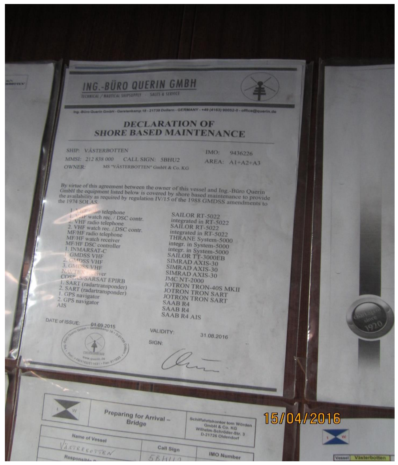
Figure 7: VDR Declaration of shore based maintenance

The "Vasterbotten" at the time of the accident, had valid certificates including an ISM certificate. The maintenance records indicated that she was maintained in accordance with existing regulations and approved procedures.