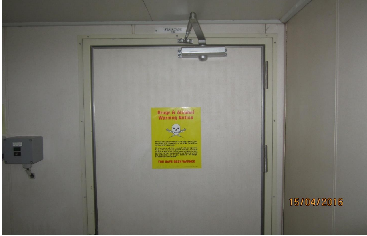
Figure 5: Drug and Alcohol warning notice posted