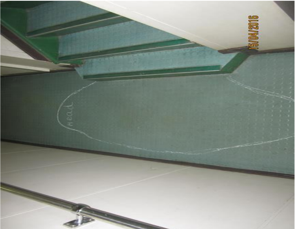
Figure 2: The accommodation's main deck internal alleyway where the C/E was lying -The position of the head is noted