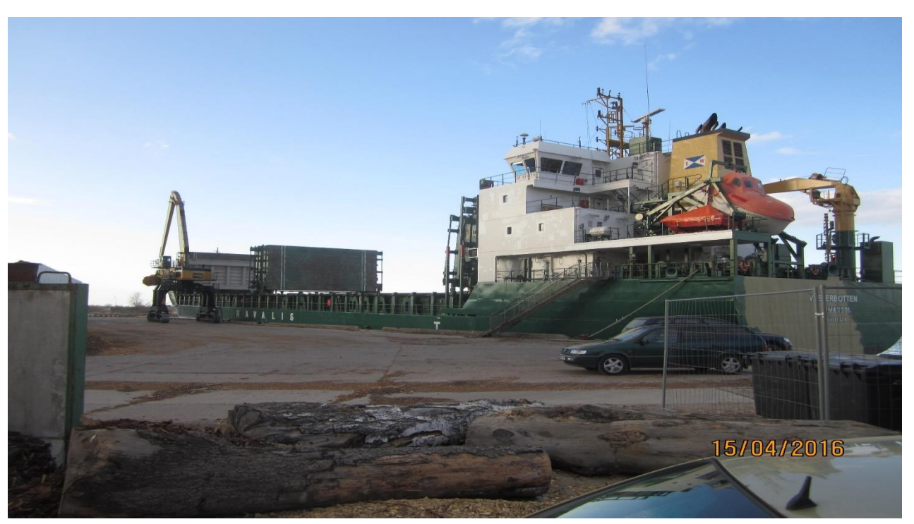
Figure 4: M/V "Vasterbotten" in the port of Mersrags-Latvia, the day after the incident - Alcohol tests to all crew members indicated BAC 0.00 except one who had BAC 0.90